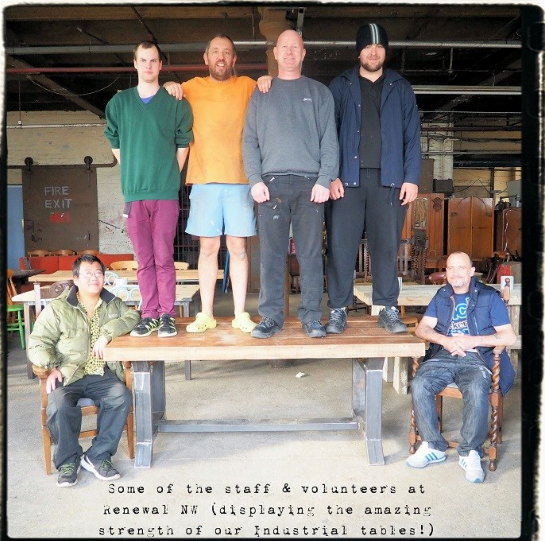
Some of the staff & volunteers at Renewal NW (displaying the amazing strength of our Industrial tables!)